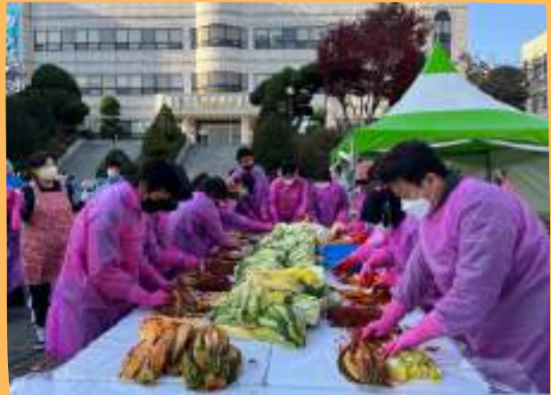
Kimchi Making Volunteering

This was a volunteering activity that we were involved in. This activity was intended to make a kimchi that would be distributed to locals. I had the chance to learn how to make kimchi, together with other IISMA awardees and Korean students. Some of the university professors also joined this volunteering, and we also had some warm conversations about studying in Korea