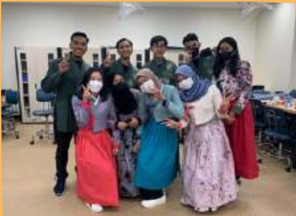
Korean Traditional Music and Dance

In this activity, we were introduced to traditional music and dance from Korea. I learned about a dance called 강강술래 (Ganggangsullae), maidens' circle dance. I also got to know about the meaning and what are the musical instruments used in this dance. We had the chance to do the dance and try to play the musical instruments, together with the other international students which also participated in this activity. We also wear a Hanbok, a traditional Korean clothes while involved in this activity.